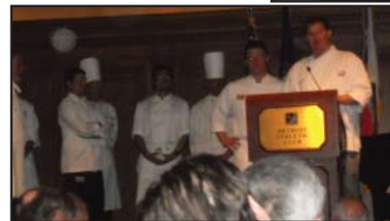
The Chefs Dishing About their Dishes