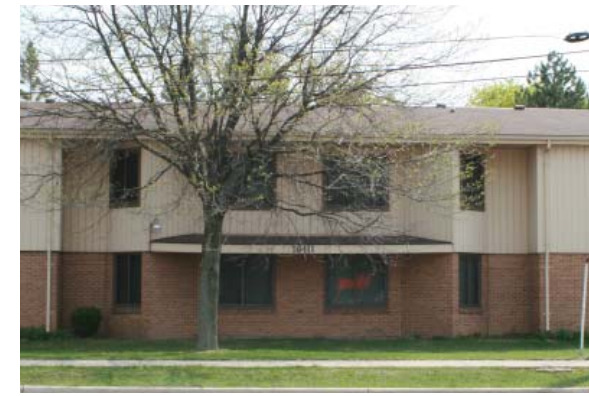
Southfield Apartments opened It's doors in 1983

The Southfield Apartments are located on 12 mile in the Bonnie Acres Community. After many challenges from the city, Mary conquered all obstacles and opened our doors in 1983. We currently have 5 men and 6 ladies living in the Apartments. Our home is unique in that it is an apartment building licensed with 24 hour staffing. There are 8 apartments, one used as the office and the others are for residents. Each apartment has a full bath, kitchen, 2 bedrooms, with a living and dining area. Staff support our residents with weekly menu planning, grocery shopping and cooking. Everyone has their own checking account, pays bills, writes and cash checks for their weekly spending with the help of the manager.